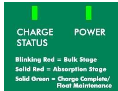
Charge Complete Float Maintenance Mode